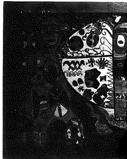
Photo taken at "E" 1945 Third Ave. New York, N.Y.