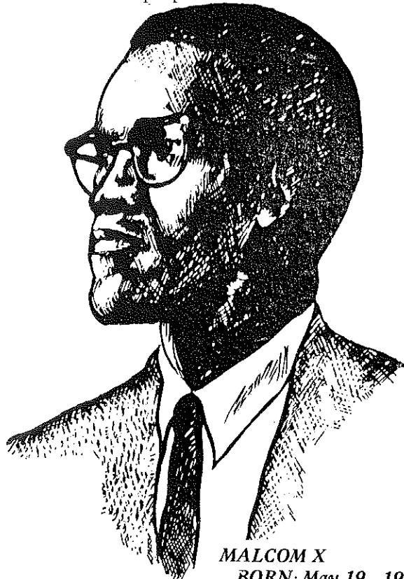
MALCOLM X BORN; May 19, 1925

Malcolm X's political experience was one of striving for unity. Although he was a Muslim and recognized Islam's influence in his subjective change, he felt the need to develop a political movement which would