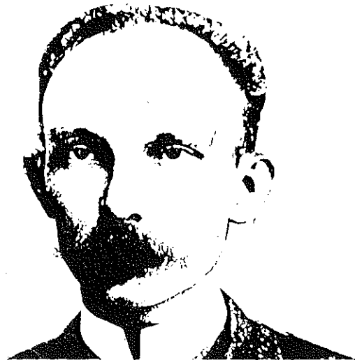
JOSE MARTI DIED; May 19, 1895

On May 19th, this day of Tri-continental significance, we in the Puerto Rican independence move-