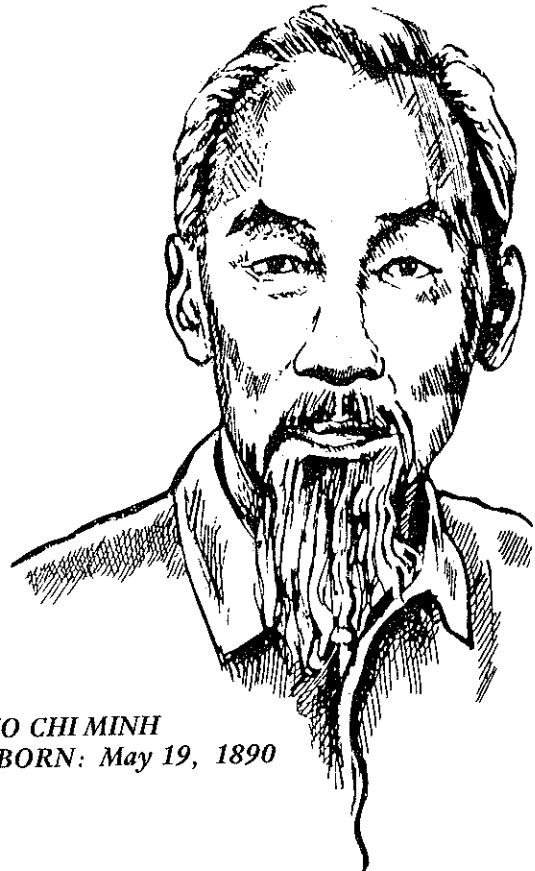
HO CHI MINH BORN: May 19, 1890

organize the New Afrikan masses based on their objective conditions of oppression.