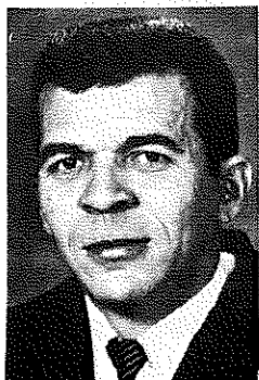
Rafael Cancel Miranda